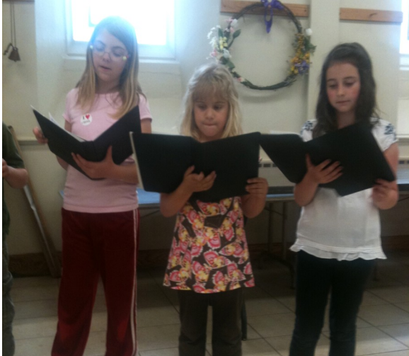
End of the Year Choir