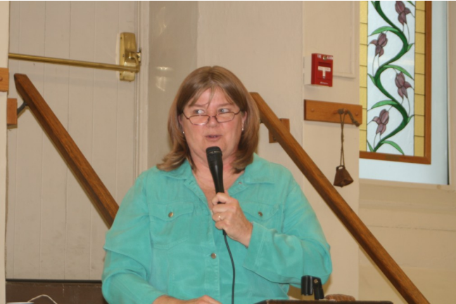
Service Auction April 30